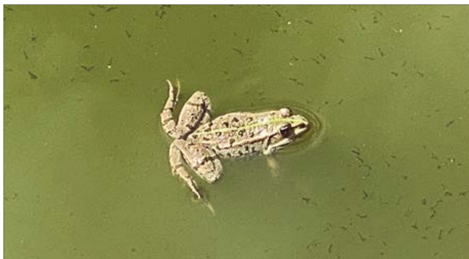
Frog on the Bonnevaux lake

The climax for Jesus was on the Cross in a moment beyond time that we cannot separate from the Resurrection. But on the Cross, planted in the earth like a tree, he released the power of compassion towards his enemies, not by saying 'I forgive you' but by connecting them to the ground of being itself: 'Father forgive them because they are trapped, tricked in their ignorance and don't know what they are doing'. Their