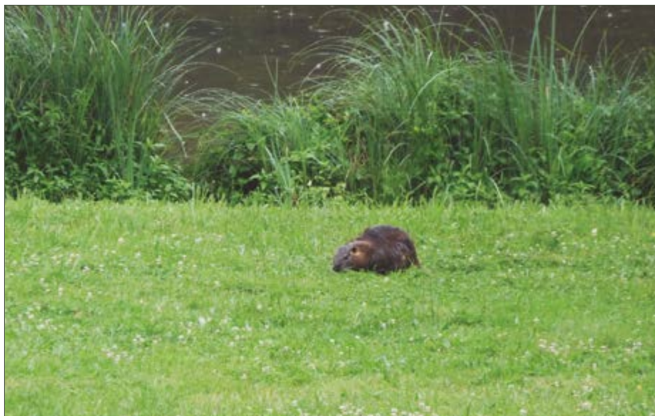
The grounds of Bonnevaux are home to a rich diversity of species

the violent turmoil of clashing opinions and judgments, this vision of beauty and its joyfulness is lost. Then the contemplation of nature cannot link us to the contemplation of the source of consciousness and to the ground of being. We burn out in the attempt to solve the ever-growing mass of problems. When they seem insoluble, we lose hope. The shaft of sunlight landing nowhere describes contemplation itself: paying attention to the no-thingness of everything, emptiness and the first of the beatitudes, poverty of spirit. In contrast, when the heart is set free from attach-