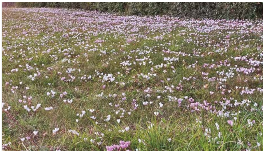
Cyclamens at Bonnevaux

After meditation this morning, a beautiful September morning, I walked in the autumn of the life cycle around the lake of Bonnevaux. The pandemic anchored me here for the past two years and graced me with the opportunity to learn more about the extraordinary wonders of the natural world that is always around us yet often ignored. As the trees change colour and the days grow shorter and the nights chillier, a profusion of cyclamen covers the woods