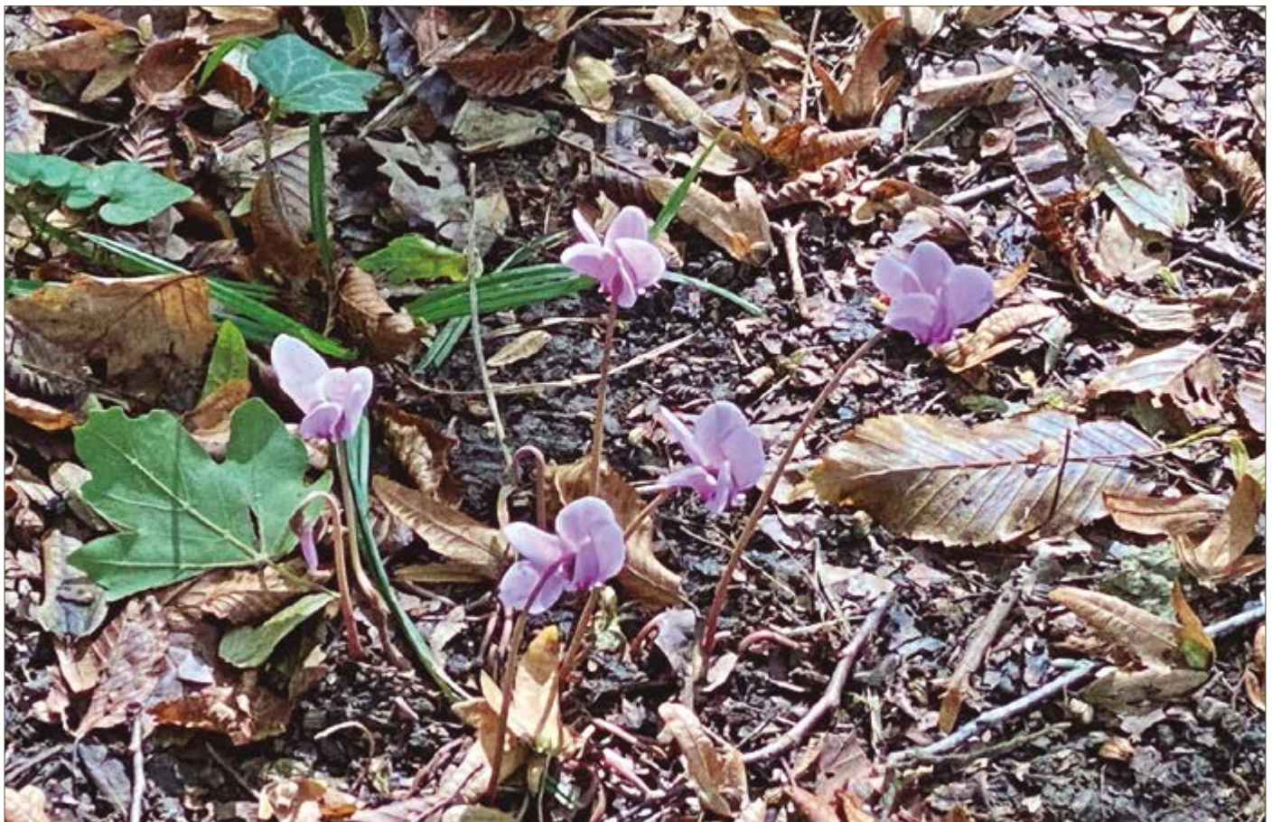
Autumn at Bonnevaux: Week after week, a profusion of cyclamen covers the woods and pathways.

ADDRESSING THE ENVIRONMENTAL CRISIS, LAURENCE FREEMAN SEES CONTEMPLATION AS THE SIMPLE PROCESS OF REPAIRING THE BROKEN CHAIN OF BEING