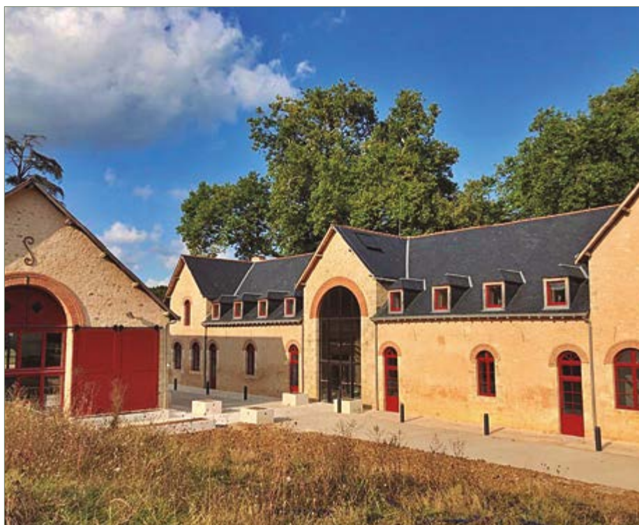
On the left, the Conference Centre (Barn) and on the right, The Retreat Centre (Guesthouse)